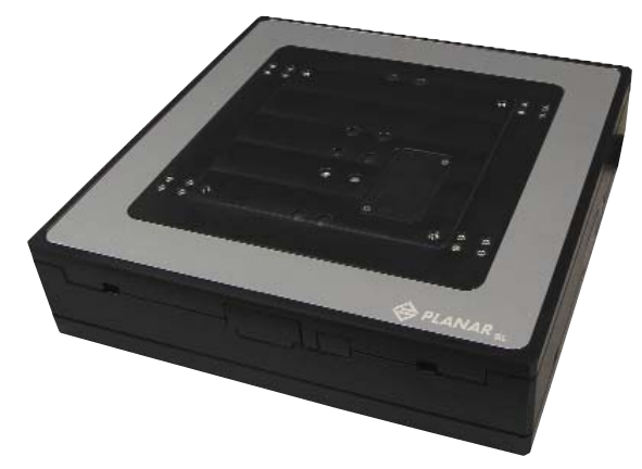
Aerotech's Planar<sub>st</sub> – high-performance in a compact, 2-axis package

Cost-effective, high-precision planar performance